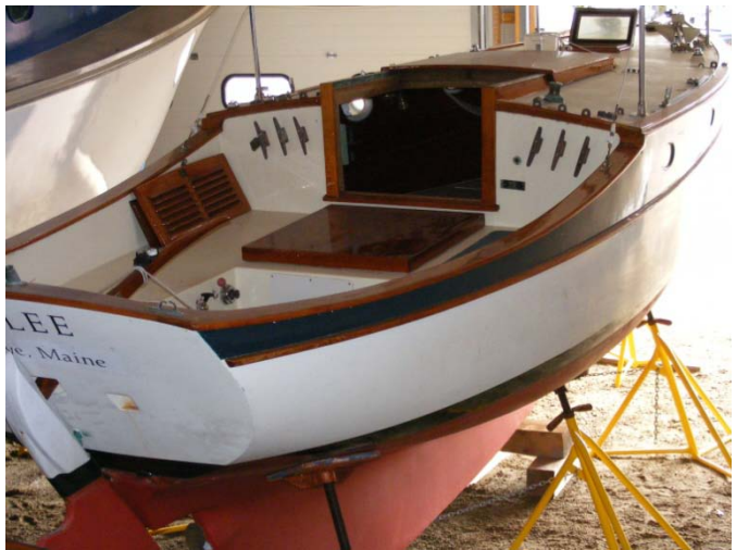
Recent photos in storage