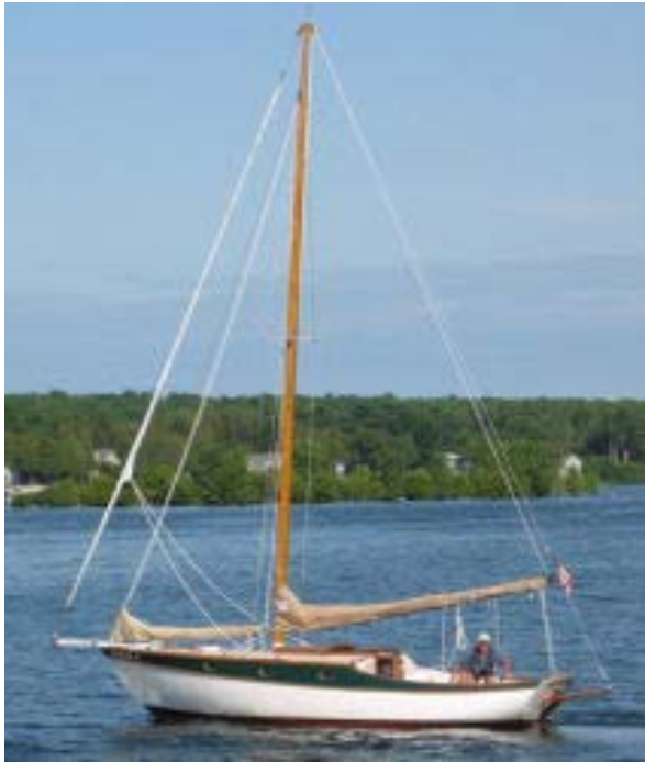
Sistership pictured above